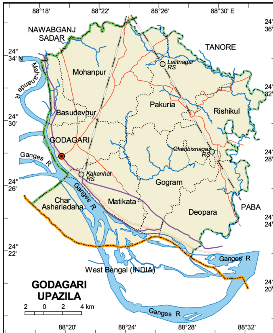
Figure 2: Map of Godagari Upazila

This study examines and compares how socioeconomic status, sociodemographic and life style attainment links between education and SPH in Muslim, Hindu and Santal adult men in rural Bangladesh. In so doing, Godagari Upazila of Rajshahi district, Bangladesh where Muslim, Hindu and Santal ethnic group live in and interact with each other was purposefully selected.